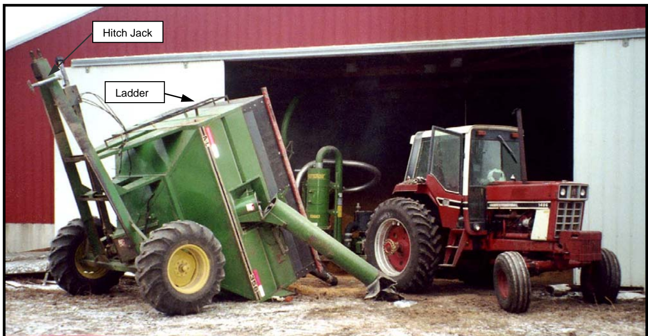
Photo 2 – Overview showing the tractor, grain vacuum, and the grain cart tipped rearward. Note the ladder on the front of the cart and the down position (for parking) of the jack attached to the hitch frame.

The grain cart was moved into position and unhitched from the tractor. There was significant weight on the tongue of the cart when it was disconnected so that its tongue jack needed to be lowered to enable unhitching, which also kept the grain cart hitch from dropping to the ground. The access ladder to this grain cart is over the hitch frame at the front of the grain box (Photo 2). The farmer climbed the ladder and stepped into the grain cart carrying the intake nozzle and dragging the hose of the grain vacuum with him. While he was suctioning grain from the front of the cart, at some point in time the weight of grain ahead of the rear axle was reduced such that the remaining grain behind the rear axle of the cart was enough to cause the cart to tip rear-ward.