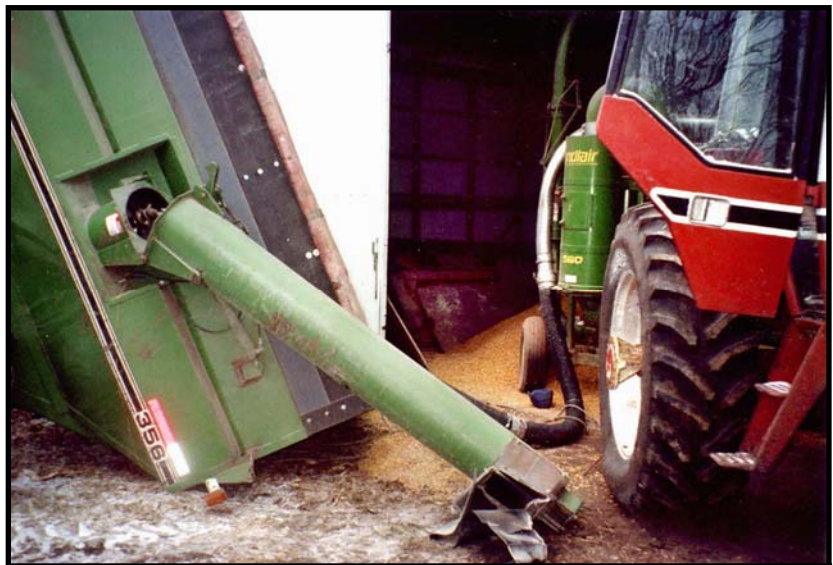
Photo 1 – Grain cart tipped onto its rear beside tractor used to power the portable grain vacuum that conveyed corn into the machine shed.

During the winter of 2005, an 81-year-old farmer died while pneumatically conveying corn from a parked auger wagon into an area of his machinery storage shed. He was standing in the corn near the front of the single-axle grain cart, which had been unhitched from the tractor. The PTO-driven grain vacuum was positioned in the doorway with the tractor connected to it, to provide power take-off (PTO) power, at an angle to it outside the doorway (Photo 1). When a sufficient amount of corn had been vacuumed from the front of the wagon, the weight of corn remaining in the rear of the wagon caused the cart to tip rearward. The farmer was catapulted into the air and landed on the concrete machine shed floor beside the tractor. He suffered a fractured skull and was rushed by ambulance to a regional medical center where he died the next day.