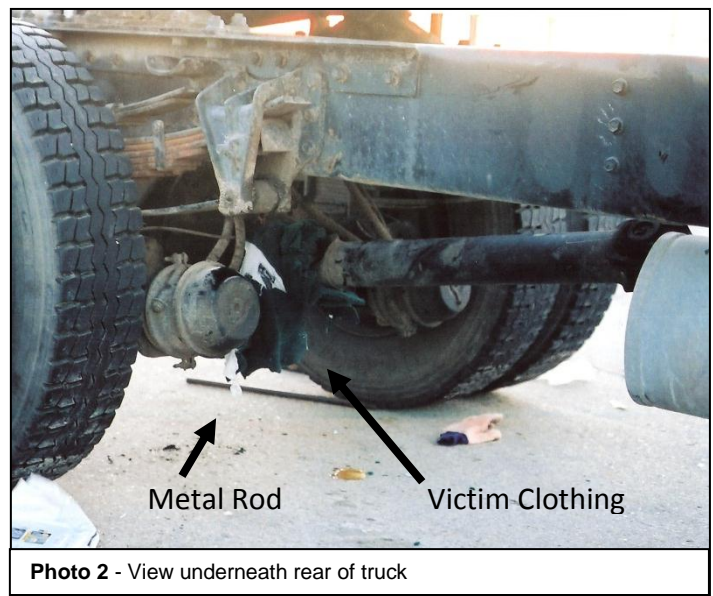
Photo 2 - View underneath rear of truck

metal bar with which to manually release the brakes. The truck was left running at idle speed with the transmission in gear. This truck was equipped with an automatic transmission and torque converter that allows the truck to remain stationary while in gear. The truck's transmission control did not have a "park" position. The parking brake was not engaged. The operator then crawled under the truck with the tools to forcibly free the frozen brakes. He successfully released the brakes, which allowed the truck to move forward. As the truck moved, the victim's clothing became entangled in the universal joint (u-joint) on the revolving drive train. (See photos 2 and 3.) The victim was lifted off the ground and pinned against the frame of the truck causing the drive shaft to stop rotating. The compression of the victim against the frame led to his death by