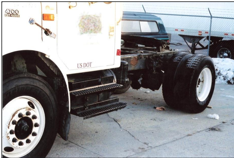
Photo 1 - Driver's side of truck tractor

On the morning of the incident, the victim was scheduled to deliver the truck to the Kansas City area following vehicle service. The victim had been seen by coworkers just before 4:30 a.m. sitting in the cab of the running truck. It is believed that upon attempting to release the brakes to move the truck the victim found that they would not release perhaps in part due to the fact that the truck had been sitting outside in cold weather for five days prior to the incident. There was no trailer attached to the truck at the time of the incident.