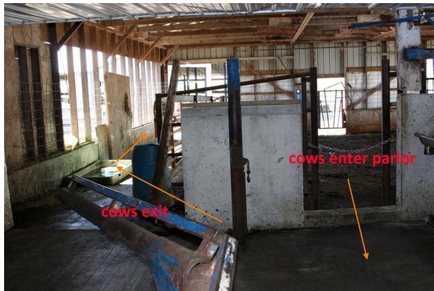
Exhibit 3: Path of cows into and out of milking area. Victim was found at gateway where cows enter parlor.

The daily chores performed by the couple were routine over the years. The wife brought cattle from the nearby barn into the holding area. Cows filed from the holding area into the two open milking areas on either of the milking equipment. The wife secured cows in the two milking areas with metal gates (no longer used at time exhibit photographs were taken) and went into the central area to attach milkers.