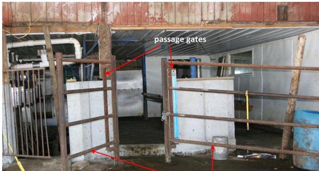
Exhibit 2: Location of passage gates. The overturned gray bucket on floor represents where a person would be protected if they went through the right-hand passage gate.

The restricted end of each funnel gate had a 'passage gate,' which is a narrow opening configured by the offset section of vertical steel tubing welded to the end of the funnel gate. The passage gate is a design feature providing a protected area, or 'safe zone', on the back side of the funnel gate. A person can move through the passage gate into the protected area to avoid being crushed or squeezed