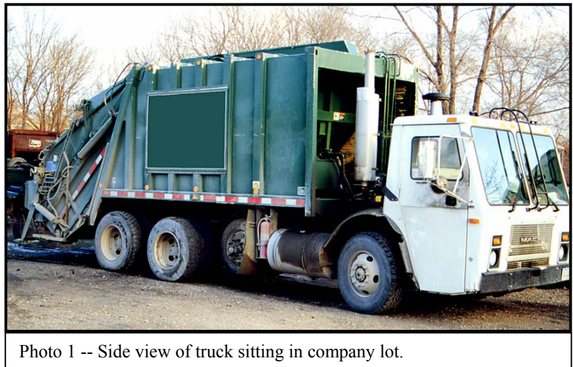
Photo 1 -- Side view of truck sitting in company lot.

A 19-year-old man was killed while riding on the back of a garbage truck. The driver and his helper were collecting garbage on their normal route through a residential mobile home park. The victim was a relative of the helper, and was allowed by the driver and helper to ride along. He was not employed by the waste collection company, but was simply volunteering to help his friends on their normal pick-up route. This was