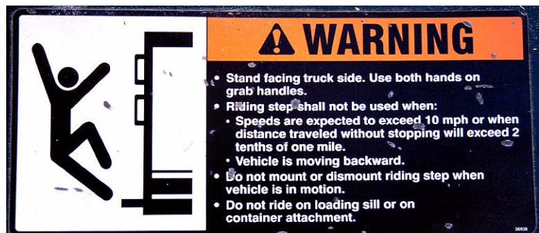
Photo 4 -- Close-up of warning decal on side of truck.

1.) There shall be no unauthorized riders on the truck at any time, 2.) No standing riders are allowed on the truck when backing up, 3.) The helper must assist the driver when backing up, 4.) The helper must be in eye contact with the driver while backing up.