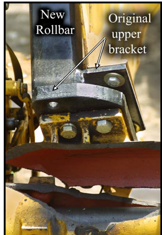
Photo 3 – Close-up view of right axle showing construction of rollbar and its attachment to the axle housing with short bolts. This also shows the original ROPS upper bracket with fender attachment, repainted to look new (refer to Diagram).