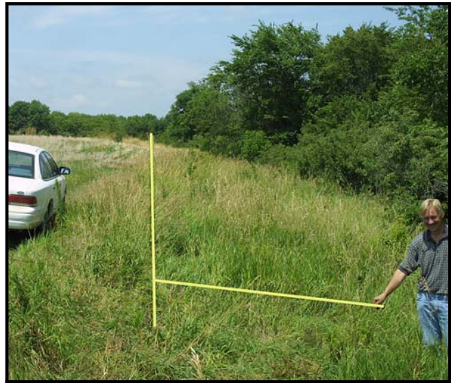
Photo 5 – Site of the overturn showing the location of the post and the downward ground slope of 8 degrees.

The victim and his grandfather were removing an electric fence line surrounding the old pasture (see Photo 5). The fence was made of 6-inch (15 cm) diameter creosote wooden posts (see Photo 4) and small fiberglass posts between the wood posts. The posts appeared relatively new, and were in good condition. They were eight feet (2.4 m) long and set approximately 4 feet (1.2 m) deep in the ground. The fiberglass posts were easily removed by hand, but the wood posts required significant force. Initially, the grandfather attempted to pull this post using the 3-point hitch lift arms of the tractor. This was unsuccessful, for the hydraulics did not have enough power. Their alternate method was to use the rear wheel and a chain, which had worked successfully prior to this incident. They backed the tractor in position with the right rear wheel adjacent to the post. A chain was attached to the base of the post, and the other end looped through the rim and around the rear tire. On other occasions, when the rear wheel turned, it would yank the post up and forward out of the ground, making it a quick and easy method to remove posts, something the grandfather had learned from his father long ago.