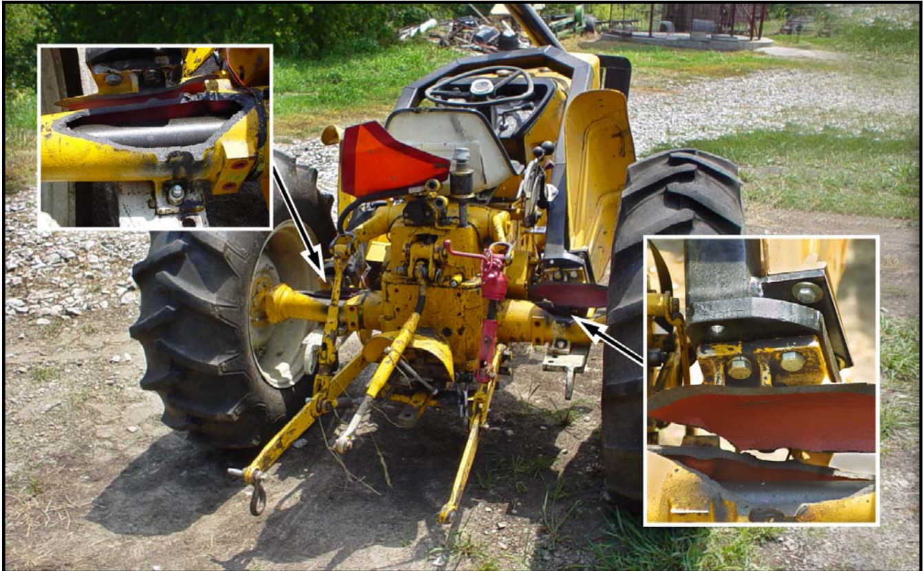
Photo 6 – Rear view of tractor with inserted photo enlargement of left and right broken axle housings.

tractor forward, the post did not budge, but the tractor's front end immediately jumped upward. The grandfather yelled for him to push in the clutch pedal, but there was no time to react or stop the overturn. The front end continued to rise and the tractor rolled over backwards, slamming to the ground and instantly killing the boy. The rollbar collapsed and failed to provide protection. It did not bend or break, but the cast iron axle housings on both sides broke, leaving large pieces of the