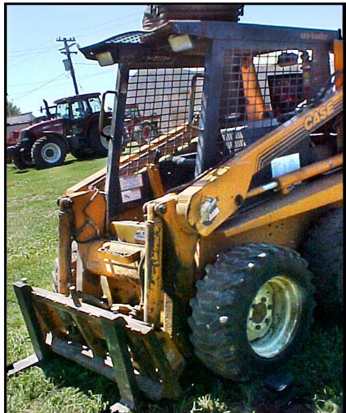
Photo 1 - Skid steer loader with forklift attachment on lift arms.

The repairman was working alone inside his shop in the middle of the afternoon. A customer had stopped by sometime after noon with additional work to be performed, and planned to return in an hour and a half. Upon returning to the shop, the customer discovered the repairman pinned against the front of the skid steer frame by the back of the forklift attachment, which was now