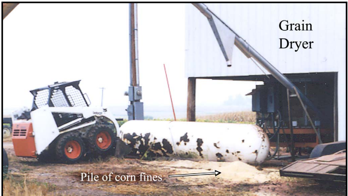
Photo 2 – Back view of the area showing skid-steer loader, overturned tank, the grain dryer, and the pile of corn fines.

It had rained the night before, so it was possible for Sheriff's investigators to determine where the loader had been operating that morning by observing fresh tracks in the dirt. It appeared that while loading up fines with the bucket, the farmer accidentally backed into one end of the propane tank, knocking it off its concrete foundation. Fresh marks in the paint on the tank and tracks in the dirt suggest the farmer was trying to re-position the tank after it had tipped over on its side, toward the grain dryer. The top-mounted valve (see Photo 1) had struck a dryer pole and was venting propane. The farmer moved the loader to the opposite end of the tank and raised the bucket, possibly preparing to reposition the tank with a chain. Considering the noise level from the dryer and the skid-steer loader, it's not clear whether he heard the sound of the leaking propane. However, it is likely he noticed the odor of the leaking gas, and knew it was an explosion hazard. Either the grain dryer, which was running, or the skid-steer loader itself could ignite the propane, and the farmer was likely aware of this and had great urgency to correct the situation.