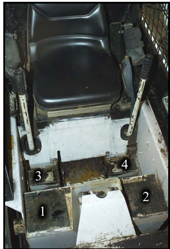
Photo 4 – Front view of operator compartment showing hand controls and four areas for the operator to step on.

Discussion: A previous owner of this machine had added risers to the heel portion of the foot pedals. The pedal linkages were worn, and needed adjustment or repair. It appears the heel position for raising the lift arms and tilting the bucket up had become awkward, and to correct this, the quickest solution for the previous owner was to add more height to the pedals with metal risers. One of them was welded, and the other was fitted between the slots of the pedal. These modifications reduced room in the already tight space in the foot wells, creating more clutter and points where the feet could get caught and accidentally activate the hydraulic controls. It's not clear whether these modifications were a factor in this incident, however, they could compromise safe operation of the machine.