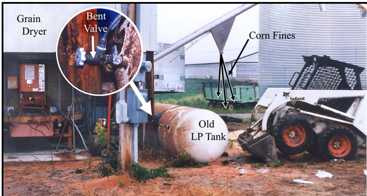
Photo 1 – Side view of area showing skid-steer loader in the position it was found, overhead grain auger, propane tank (liquid petroleum, LP) overturned against a pole for the dryer, and a close-up of the bent propane valve.

During the fall of 2003, a 46-year-old Iowa farmer was killed while operating a skid-steer loader on his farm. He had purchased the loader recently, and was using it to remove corn fines from a grain handling area into an adjacent field. While doing this, he apparently backed the loader into a 1,000 gallon (3800 L) propane tank and knocked it off its concrete block foundation. The tank tipped over sideways towards a grain dryer, which was running, and the valve on top of the tank hit a post and started venting propane. The LP tank was nearly empty and was to be filled that morning. The farmer positioned the skid-steer loader near one end of the tank, with the bucket raised and the engine running. He apparently leaned or stepped out of the loader, and accidentally activated the foot pedal controlling the height of the loader lift arms. As the bucket came down, he was pinned under the bucket against the loader frame on the left front side.