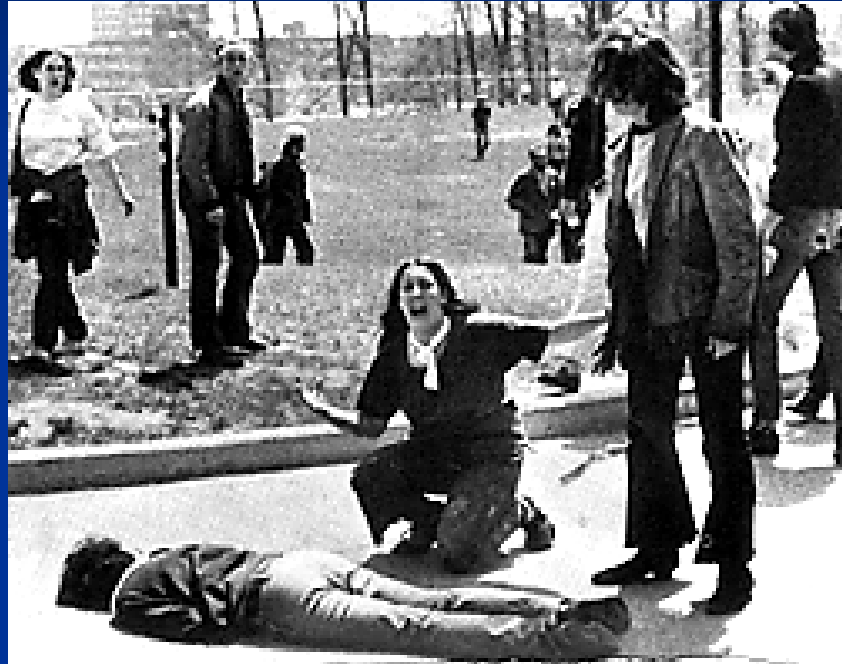
Pulitzer Prize-winning photo by John Filo