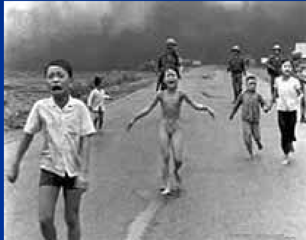
Vietnamese Girl Fleeing in Terror After a Napalm Attack , Nick Ut (Vietnam, 1972) © Associated Press