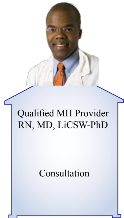
Specialty Mental Health Clinic