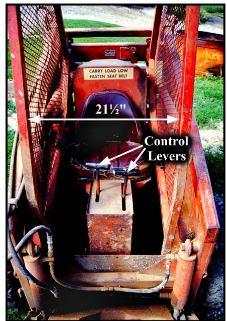
Photo 2 -- Front of skid loader showing narrow ROPS cage.

The loader was found to be in normal operating condition after this incident, and there was no evidence of any mechanical failure. Family members say the victim had recent complaints of