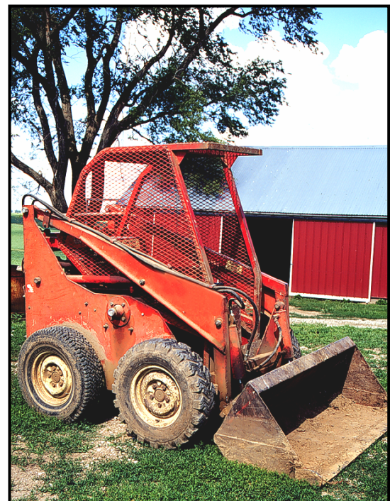
Photo 1 -- Old skid-steer loader with ROPS cage re-attached by new owner.

A 69-year-old farmer was found dead while cleaning snow from a hog-sorting pen. The man was driving a small skid-steer loader, which was 20-30 years old. The man was working alone, and details of the incident are unclear. He was found sitting in the operator's seat, leaning to his left, with the left hydraulic lift arm pushing down and crushing his chest against the machine frame. The man's hands were next to the control levers for the machine, which has led family members to suspect he may have lost consciousness prior to being pinned by the machine. There was nothing obviously in the vicinity that the man could have been reaching for. The work surface was flat concrete, and he was moving snow, as he had done many times before with the same machine. He had removed the protective cage on the machine years ago to provide access to an old-style hog house, so there was no protection between the operator and the hydraulic lift arms. He had owned this skid-steer loader for many years, and was very accustomed to using it without the cage.