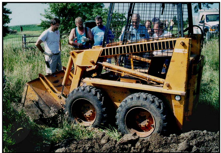
Photo 1 -- Side view of skid-steer loader after the incident.

A 60-year-old operator of a skid-steer loader was killed while moving dirt at his rural acreage. The man was moving and smoothing soil, preparing to make a foundation for a new barn. The area was level and the soil was dry. To increase the hauling capacity of the front-end bucket, the man had attached four 45-kilogram (100 lb.) tractor counter weights to the rear of the skid loader with a chain. It appears that while backing up with a raised bucket full of dirt, the chain and counter weights