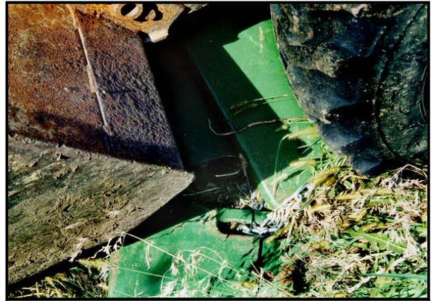
Photo 3 -- Tractor weights seen under the bucket.

The weights were found underneath the victim and the bucket (see Photo 3). It is not fully clear how the bucket came down and crushed the victim between the bucket and the loader frame. It appears that there was a leak in the hydraulic control system, for rescuers stated that the lever had to be pushed constantly to keep the bucket raised. This problem may have been present before the incident, or it may have been caused by the incident. The overload of dirt in the bucket, and the violent movement of the machine could cause significant loading and failure to the hydraulic system. No further testing was done to identify mechanical failure in this hydraulic system.