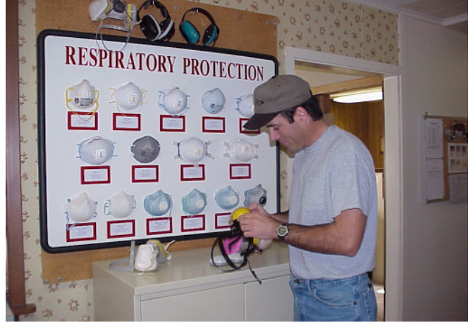
Education and fit testing of various types of respiratory personal protective equipment are part of the Certified Safe Farm program.

CSF is a collaboration of several organizations, including Iowa's Center for Agricultural Safety and