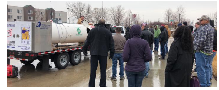
Two anhydrous ammonia safety workshops were held at MRASH.

weather—Neenan also showcased the anatomy of the anhydrous tank outdoors and presented real life case studies for discussion. Both sessions at the conference had more than 25 participants. Participants were able to take home some samples of personal protective equipment.