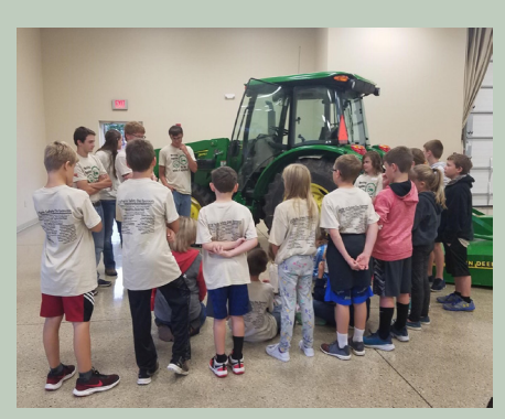
Farm safety information was presented to 4th grade students in the St. Ansgar and Osage school districts.

In this project Mitchell County 4-H County Council, along with St. Ansgar and Osage FFA Chapters, planned and presented farm safety information to 130 4<sup>th</sup> graders in the St. Ansgar and Osage school districts. FFA chapter members developed and delivered presentations to the students and assembled and distributed first aid kits.