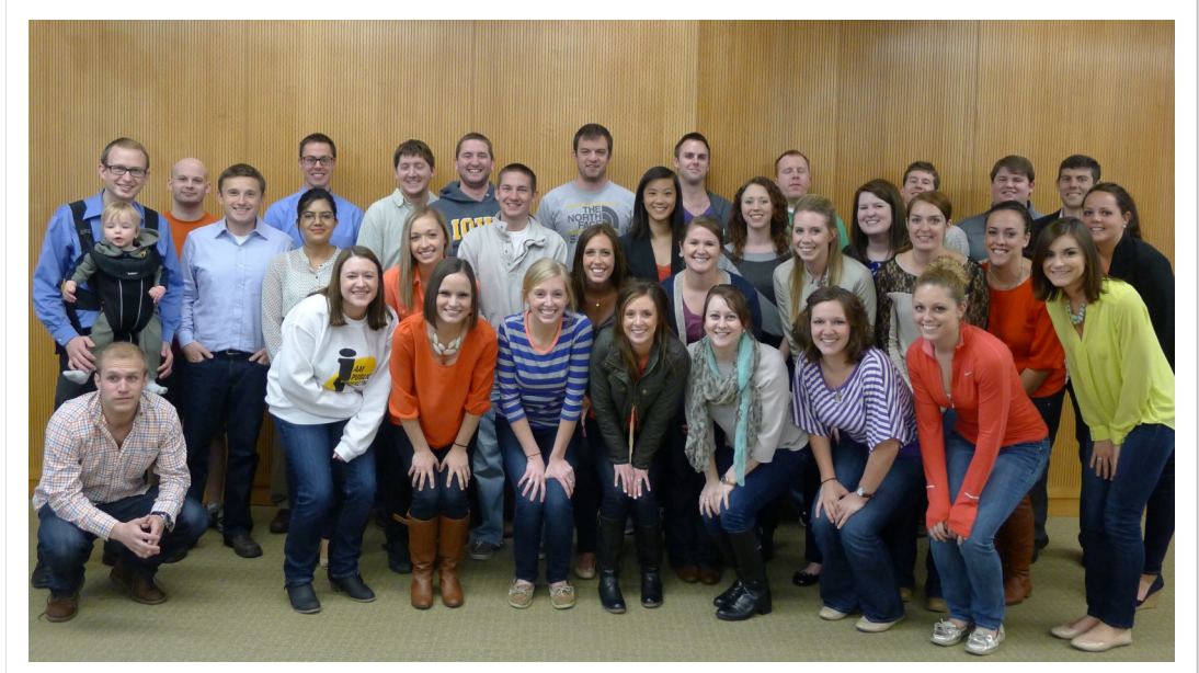
ISAHL members at the end-of-the-year potluck