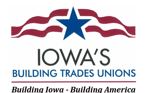
Carpenters Local 1260